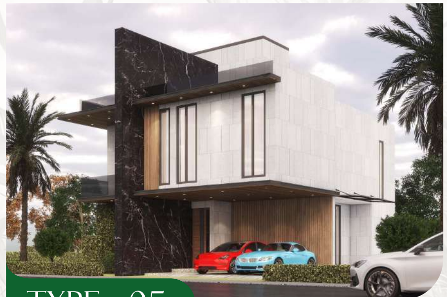
TYPE - 05

C2 - 3500 sq. ft. D2 - 3400 sq. ft. D3 - 3450 sq. ft.