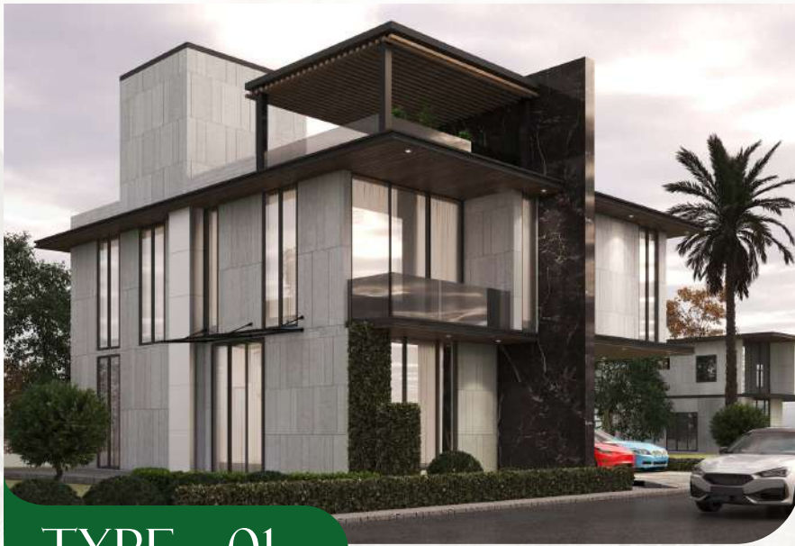
TYPE - 01

RAMS Palm Shore Drive Mansions features 12 independent villas, each designed with a modern aesthetic that reflects elegance and style. With sizes ranging from 3,400 to 4,000 square feet, these villas provide ample space for families seeking a luxurious living environment.