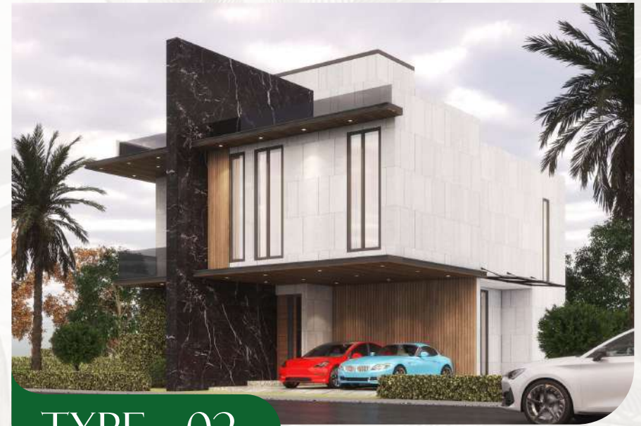
TYPE - 02