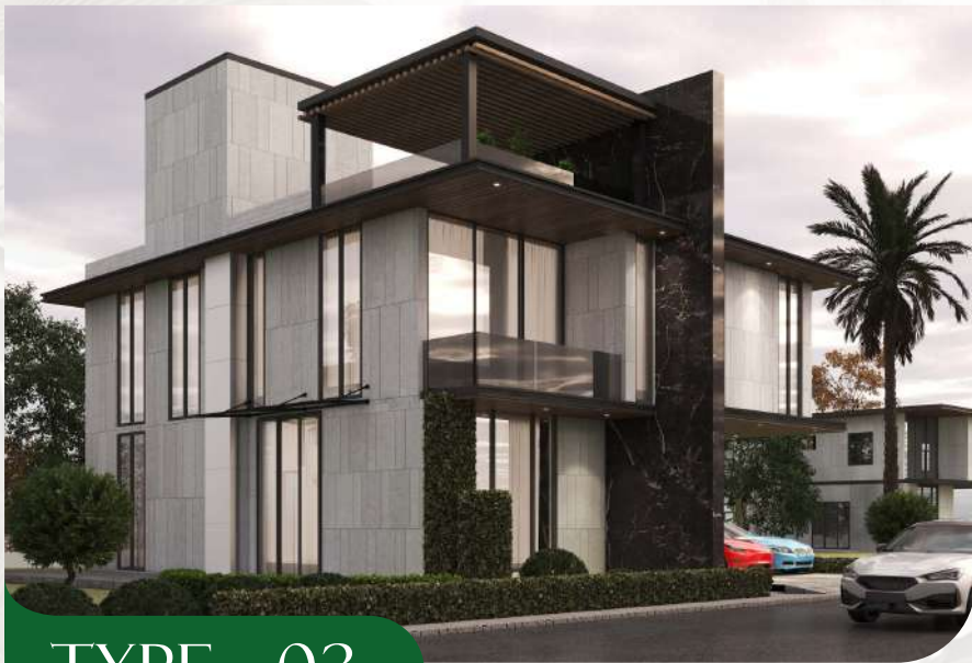
TYPE - 03